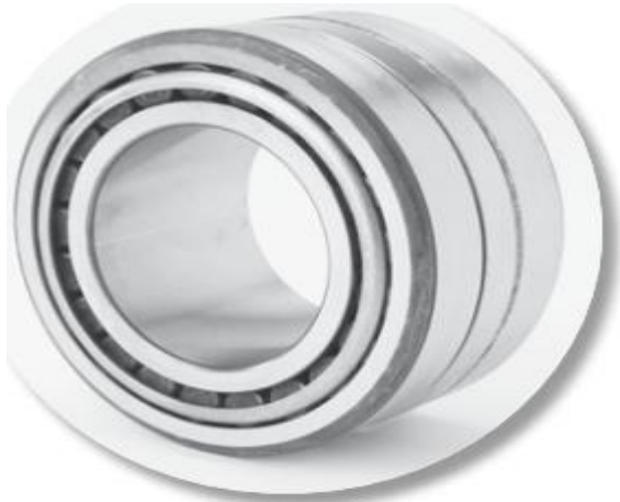
DOUBLE-ROW • TYPE TDI